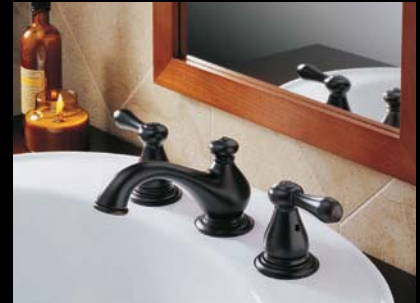
Widespread Lavatory Faucets