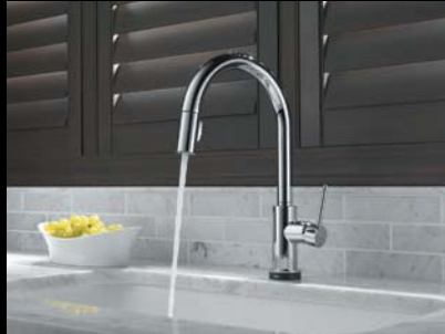
Touch 2 O Technology Kitchen Faucets

Pull-down faucets from traditional to contemporary style. Lavatory models in single-handle or widespread. Touch 2 O ® and Touch 2 O. xt ™ Technology faucets. You'll find DIAMOND ™ Seal Technology in a variety of faucet configurations, and in nearly every style or functionality that Delta Faucet offers.