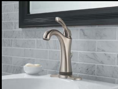
Touch 2 O. xt Technology Lavatory Faucets