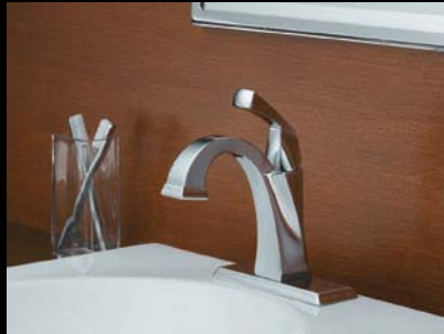
Single-Handle Lavatory Faucets