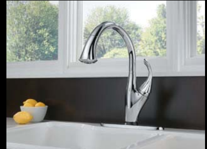
Single-Handle, Pull-Out & Pull-Down Kitchen Faucets