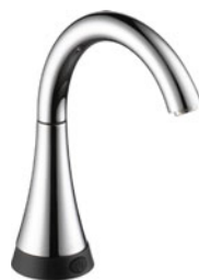
Transitional Beverage Faucet with Touch2O® Technology 1977T 1-hole installation Cold water only

Touch2O® Technology— Start and stop the flow of water with the tap of a finger or forearm.