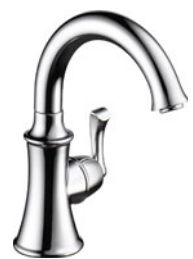
Traditional Beverage Faucet 1914-DST 1-hole installation Cold water only