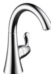
Transitional Beverage Faucet 1977-DST 1-hole installation Cold water only