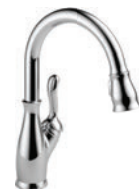
SINGLE-HANDLE PULL-DOWN 9178-DST 1 or 3-hole installation MagnaTite Docking Optional escutcheon included