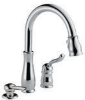
SINGLE-HANDLE PULL-DOWN 978-DST WITH RP50813 SOAP DISPENSER 3-hole installation MagnaTite Docking