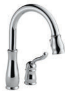
SINGLE-HANDLE PULL-DOWN 978-DST 2-hole installation MagnaTite Docking