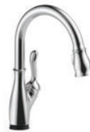
SINGLE-HANDLE PULL-DOWN WITH TOUCH2O® TECHNOLOGY 9178T-DST 1 or 3-hole installation TempSense™ Technology MagnaTite® Docking Optional escutcheon included