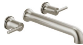
Wall Mount Tub Filler T5759-SSWL

Trim only. Order R3500-WL rough-in separately.