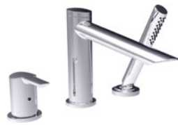
3-Hole Roman Tub with Hand Shower T3761

Trim only. Order R2707 rough-in separately.