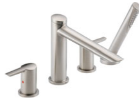
4-Hole Roman Tub with Hand Shower T4761-SS

Trim only. Order 4707 rough-in separately.