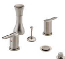
Bidet 44-SSLHP H261SS RP73816SS (finial)