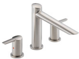
3-Hole Roman Tub T2761-SS

Trim only. Order R2707 rough-in separately.