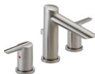
8" Widespread 3561-SSMPU-DST